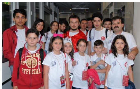
The 5 younger competitors come from Turkey. They are born in 2008, so are 9 years old.