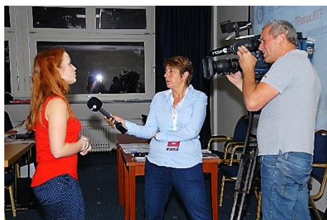
RTBF - Interview