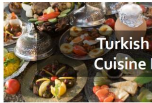
Turkish / Ottoman Cuisine Restaurant