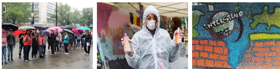
52nd Intersteno congress in Cagliari (Sardinia) from 13 to 19 July 2019.