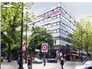
Hollywood Media Hotel