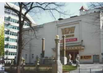
Delphi Film Palast am Zoo