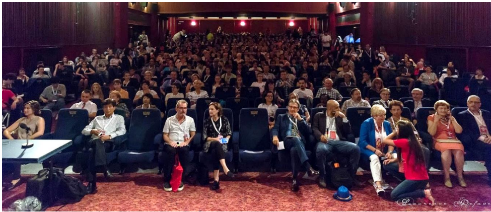
Saturday July 22 - Opening ceremony

Attendance figures show 488 congress participants including the delegates of 26 countries and 268 competitors. However, if we examine the competition figures in more detail, we can state that there was a larger important competition number: 820 competitions tests, a 46%-increase of the copies to be corrected with the same number of jury workers.