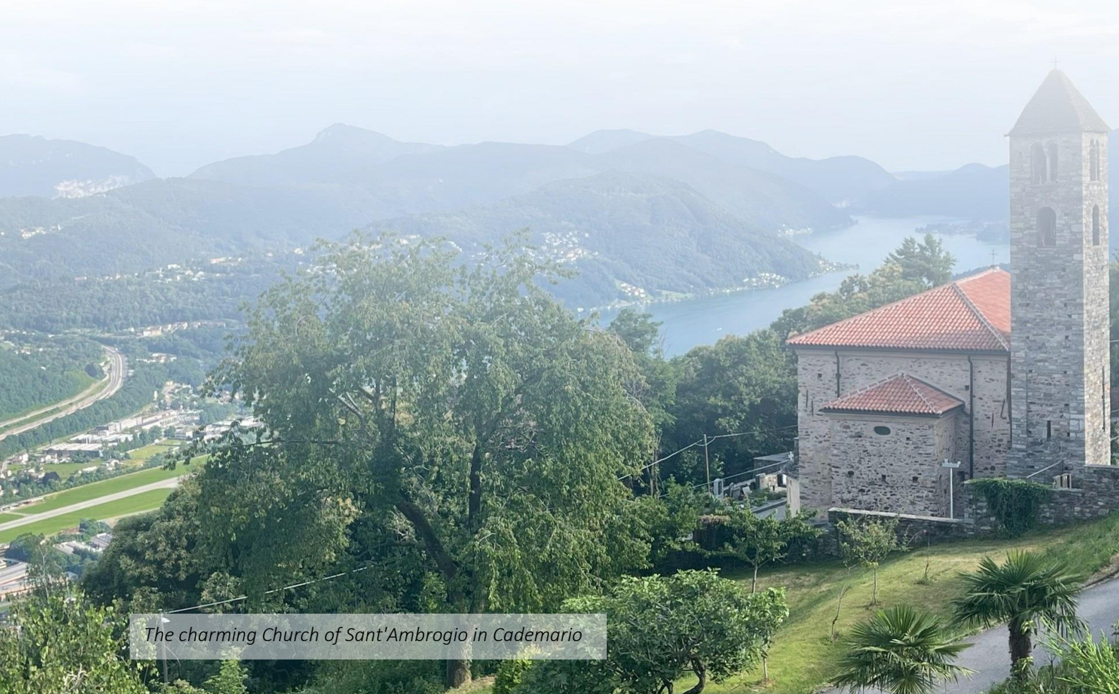
The charming Church of Sant'Ambrogio in Cademario