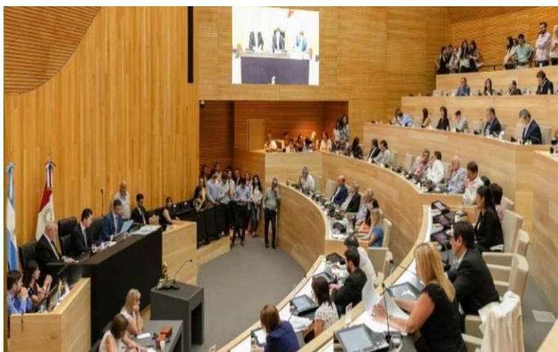
Legislature of the Province of Córdoba

Under this scheme, stenographers have experienced an increase in our services due to the increase in commission meetings. Since this process began, there have been 600 meetings, approximately 250 meetings per year. At the same time, in our stenographers' office there was a decrease in the staff, mainly due to the retirement of different co-workers. Therefore, the Córdoba Legislature Stenographers Office has the great challenge of training new applicants.