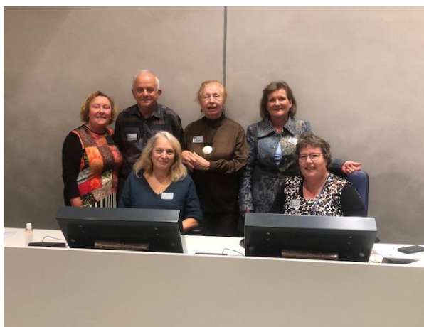
New board members and some members of Interinfo in the meeting room of the Dutch parliament