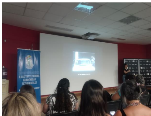
Exchange of experiences at the National University of Córdoba