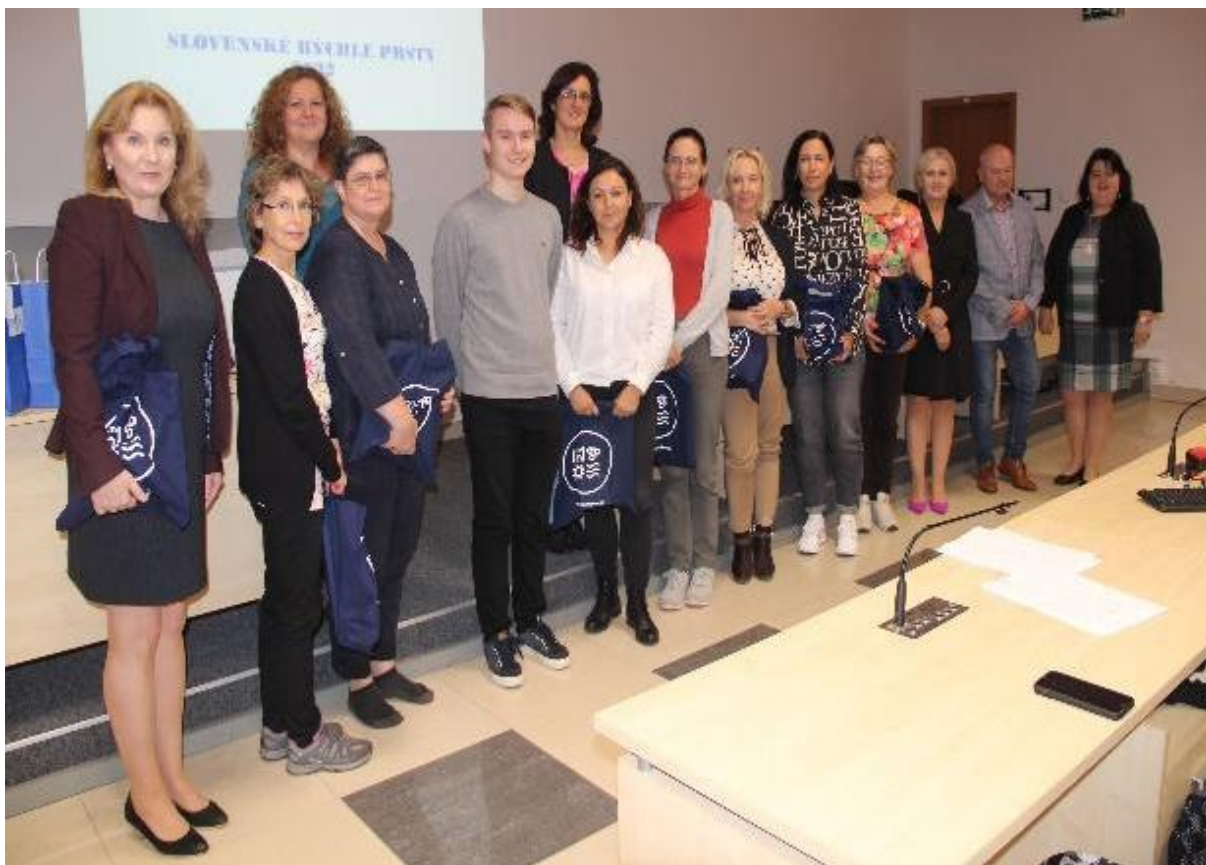
All the teachers who accompanied the students and learned a lot of new things