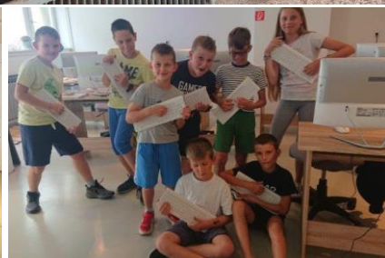
Students of elementary school

In the historic area of the Old Town Hall on Upper Town in Zagreb, on Wednesday, September 14, 2022, a ceremonial academy was held on the occasion of the 140th anniversary of the foundation and work of the Croatian Shorthand Association, which has been operating since its foundation on June 25, 1882.