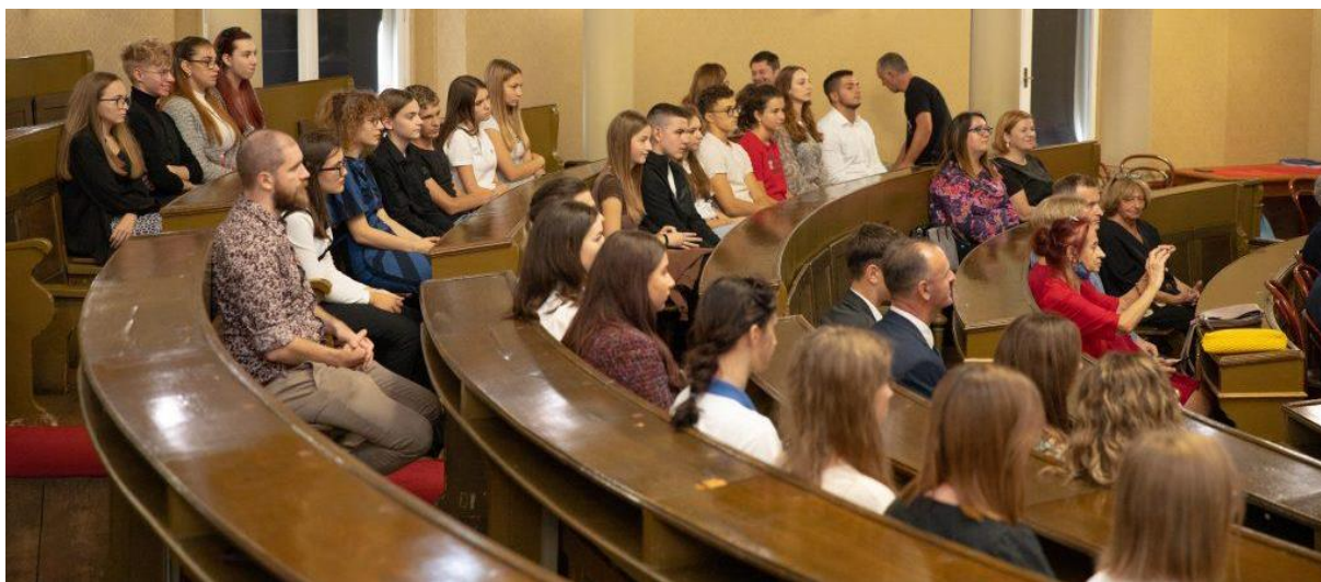
Academy in City hall

In the historic area of the Old Town Hall on Upper Town in Zagreb, on Wednesday, September 14, 2022, a ceremonial academy was held on the occasion of the 140th anniversary of the foundation and work of the Croatian Shorthand Association, which has been operating since its foundation on June 25, 1882.