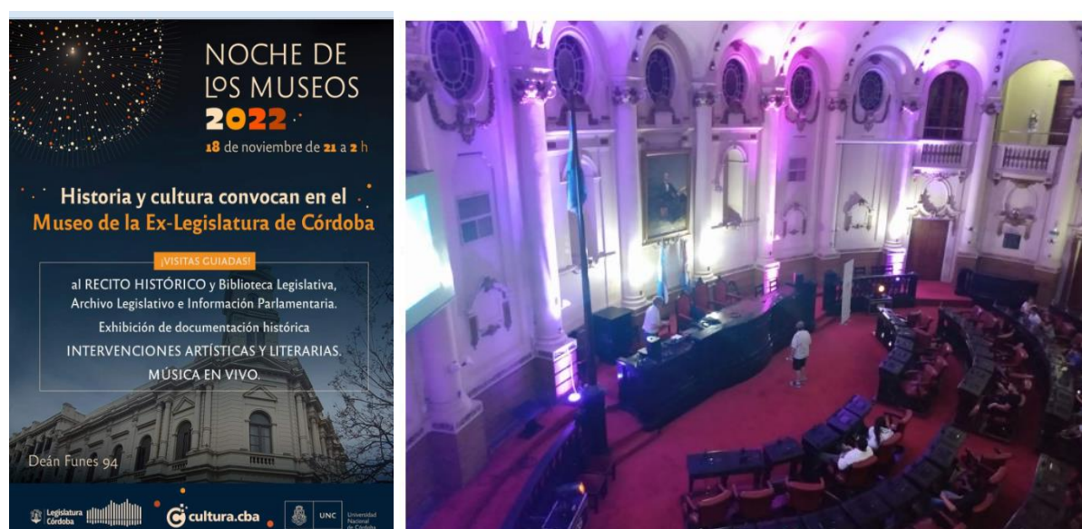
Night of the Museums in the Parliament of Córdoba

The Night of the Museums was an activity held in the city of Córdoba, and the Provincial Parliament is one of the institutions that actively participates. This activity is a great opportunity to make our profession more noticeable and to show what we do from our area. People of different ages are interested in our profession.