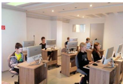
Students learning how to type