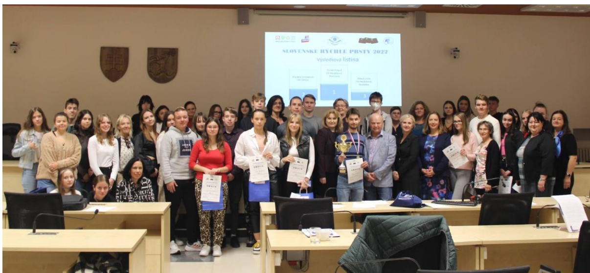
All participants at the end of the event