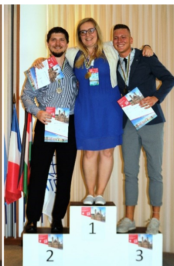
Note taking & reporting – Seniors