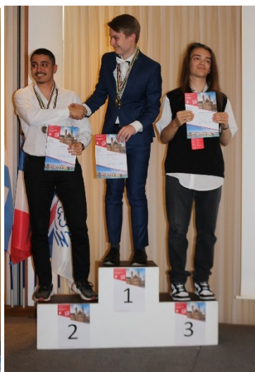
Real time speech capturing – Juniors