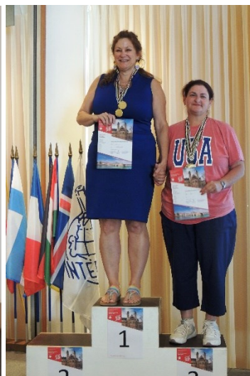
Real time speech capturing – Seniors