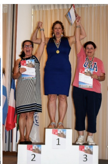
Speech capturing – Chord keyboard – Seniors