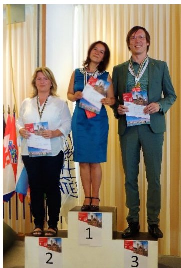
Speech capturing – Graphic – Seniors