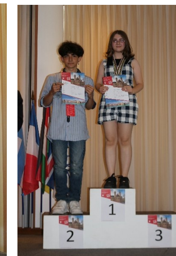
Speech capturing – Standard keyboard – Pupils