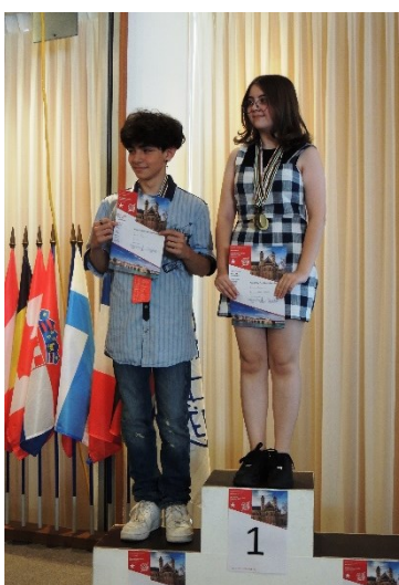
Real time speech capturing – Pupils