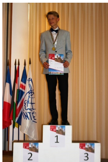
Note taking & reporting – Pupils