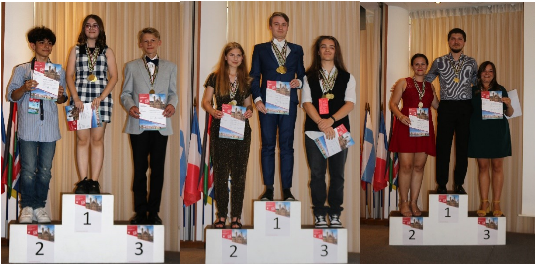
Combination list – Pupils