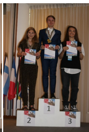
Speech capturing – Standard keyboard – Juniors