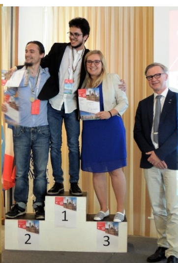
Speech capturing – Standard keyboard – Seniors