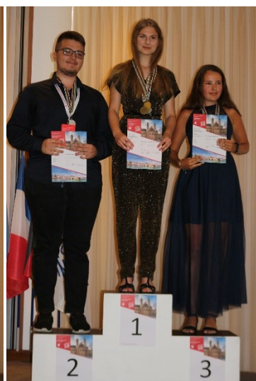
Note taking & reporting – Juniors