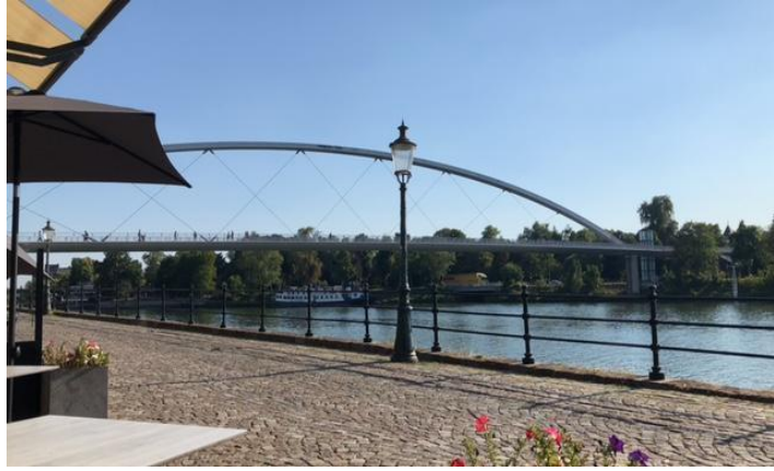
View of the river Maas

Finally, there was the farewell dinner and party. This was such an animated meeting that the author of this article only took a single photo!